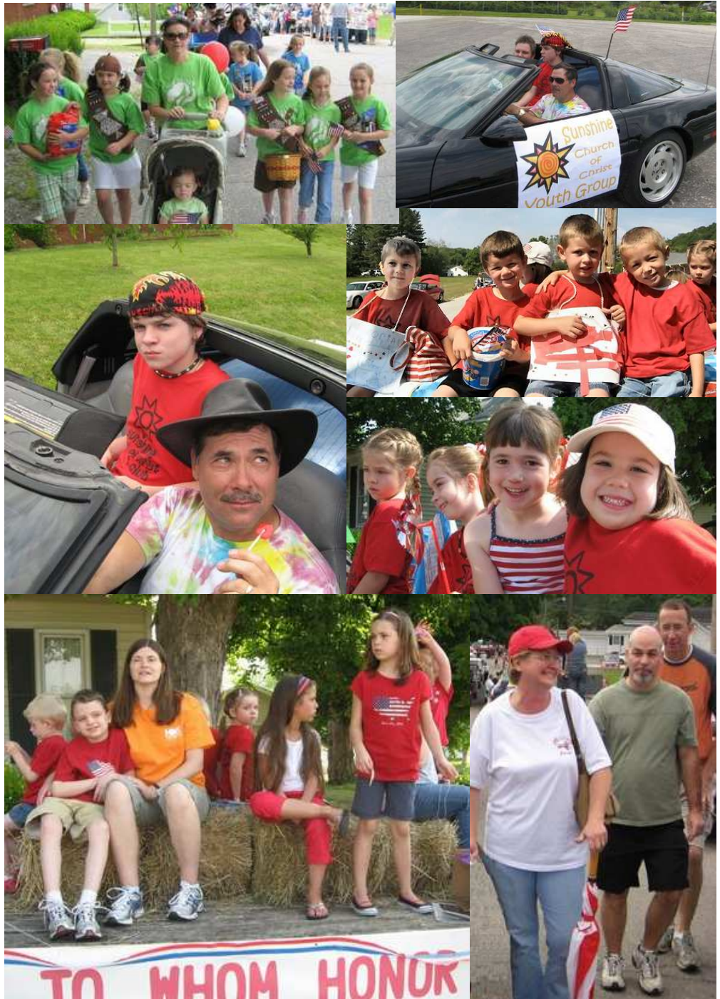
2008 Memorial Day Parade